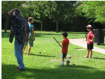
HHA members and Heights neighbors enjoying ice cream and croquet at our June 26 Ice Cream Social and Membership Drive in Marmion Park.

The Houston Heights Association gratefully acknowledges the support of the following Summer Bronze 2011 Sponsors: