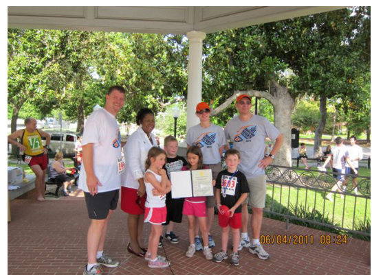
U.S. Representative Sheila Jackson Lee stopped by Marmion Park to recognize the Heights Fun Run.