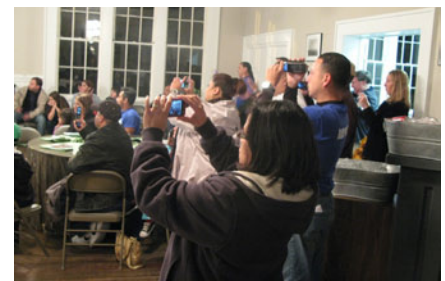
Proud parents record the performance of the Beginning Orchestra.