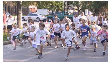
Start of the Kids 1K