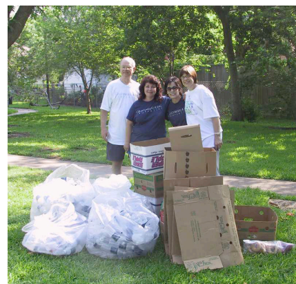
HHA volunteers recycling after the 2006 Fun Run.