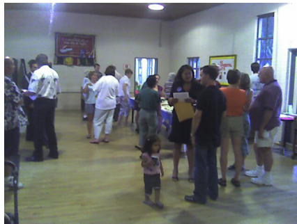
Neighbors at Milroy Park Community Center during National Night Out 2005.

The gates of Donovan Park are again being locked at night by a rotating group of volunteers. The park's hours of operation are posted on the gate.